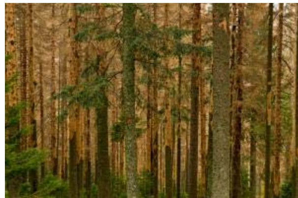
The spruce bark beetle kills trees in large numbers.

We cannot do much about the wind, but we can restrict the availability of weakened trees by clearing out windfalls before the beetles can reproduce in them. However, our analyses