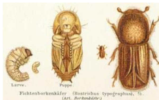
The bark beetle in different stages of development: pupa, larva, and adult (Illustration from Meyers Konversations-Lexikon, 4. Aufl. 1888)

Two bark beetle generations per year implies two flight periods and a noticeable increase in the number of attacks on standing trees each year. The effect is also amplified by the fact that spruce trees seem to have a much lower resistance to bark beetle infestation in